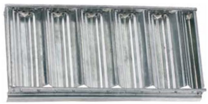
Steel OBD Damper