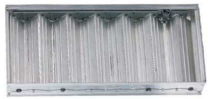
Aluminum OBD Damper