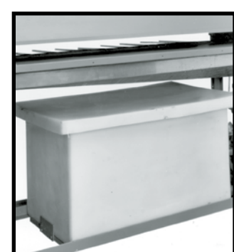
A 60 gallon covered storage tank is built into the Roto Bonder.

SPECIFICATIONS GBAC Code No. 39171 left to right flow GBAC Code No. 39250 right to left flow Motor - 1/3 horsepower motor. Pump - air operated diaphragm type Insulation Thickness - machine adjustable to coat insulation from 1/2" to 2" thick Liner Width - from 12" to 60" wide Liner Length - from 12" Speed of Application - approximately 52' per minute Adhesive - Duro Dyne WIT or WSA Water base only IMPORTANT : Flow direction is deter mined with operator standing at