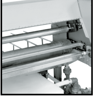
provides dependable rustproof service.

The cleanup position leaves A stainless steel trough sufficient space between the upper roll and the adhesive roll to allow for easy cleanup without endangering the operator.