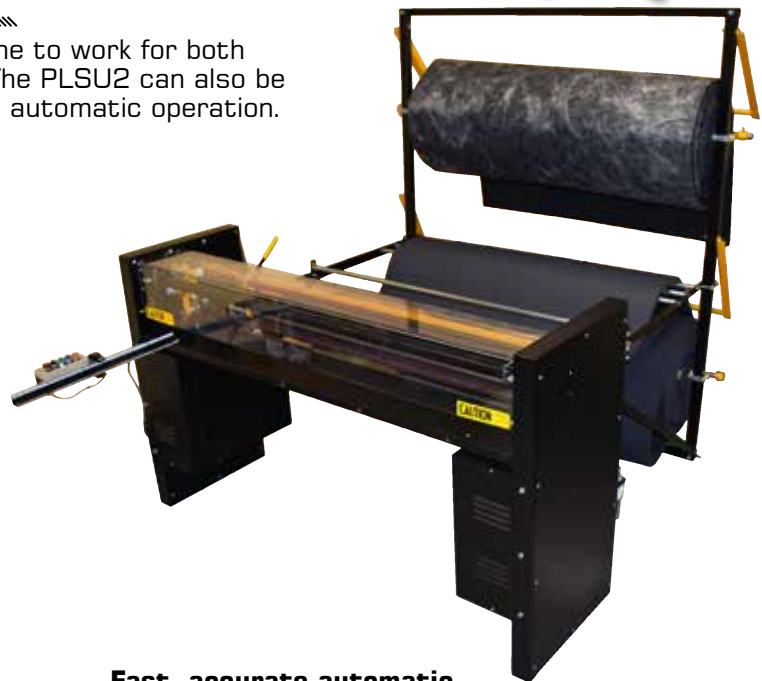
Fast, accurate automatic duct liner cutter.

THE MOST VERSATILE AND COST EFFECTIVE INSULATION CUTTING OPTION IN THE INDUSTRY!