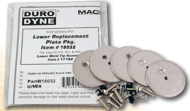
Lower Replacement Plate Pkg. Part# 18032 (replaces #17190)