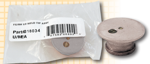
FG/RH Lo Weld Tip Assy Part# 18034 (replaces #17192)