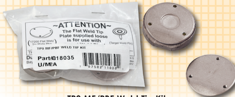
TP9 MF/PBF Weld Tip Kit Part# 18035 (replaces #27230)

Duro Dyne Corporate Headquarters, Bay Shore, NY 631-249-9000 • Fax: 631-249-8346 Duro Dyne Midwest • Duro Dyne West • Duro Dyne Canada www.durodyne.com • E-mail: durodyne@durodyne.com