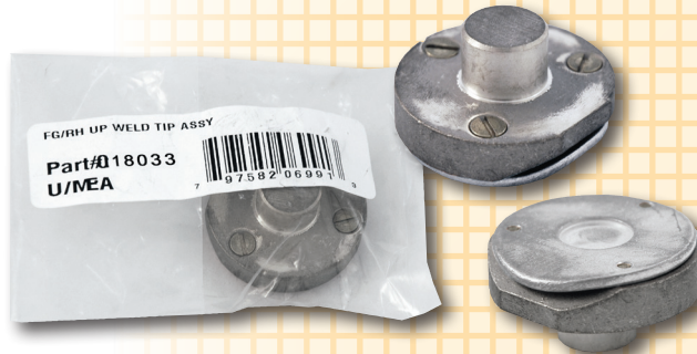
FG/RH Up Weld Tip Assy Part# 18033 (replaces #17191)