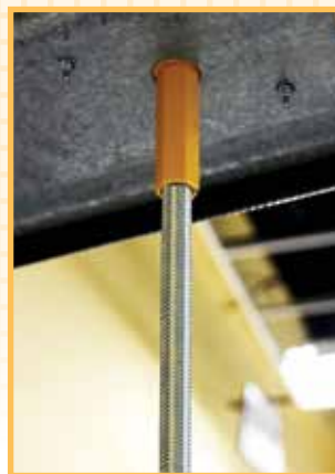
3/8" Threaded Rod