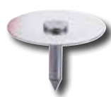
ECONO- POINT PINS