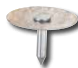
GOLD SEAL PINS

MACHINERY DIVISION © 2016 Duro Dyne Corporation Printed in USA 9/8/2016 BC039409